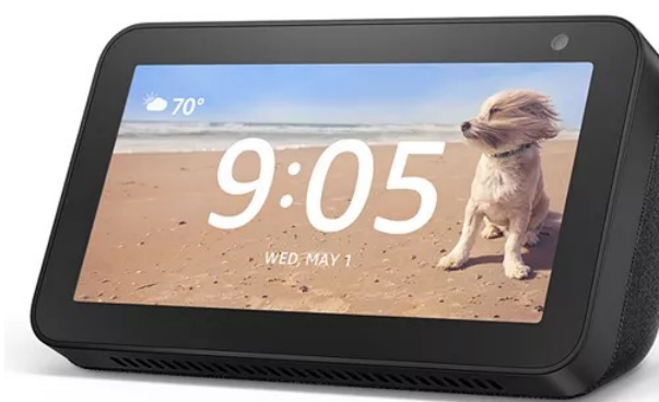
Amazon Echo Show (Voice-First Screen-Based)