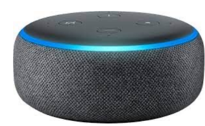
Amazon Echo Dot (Voice-Only)

Standalone Voice Assistants (VAs) are promising yet setting up & onboarding are challenging!